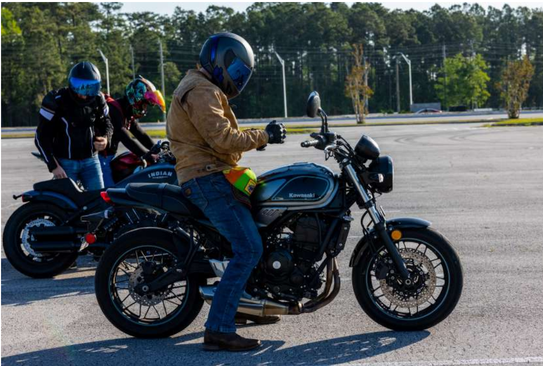
U.S. Marines with 2d Marine Division (MARDIV) participate in a Motorcycle Awareness event on Camp Lejeune, North Carolina, April 21, 2023.

Sept. 29, 5:55 p.m., 24-year-old E-3 Location: Waynesboro, Pennsylvania Remarks: Rider was cut off by a PMV-4, resulting in the Rider laying down the bike. Rider was transported to hospital and treated for road rash.